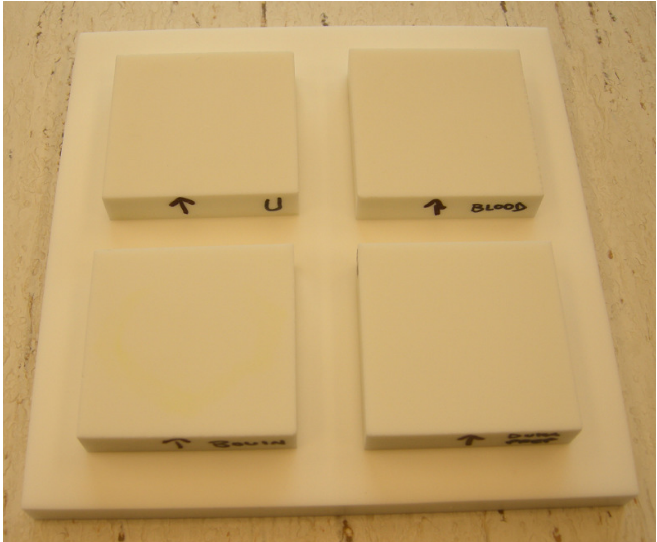
Figure 1: All 4 Stains after Final Scrubbing (Clockwise from Top-Left: Urine, Blood, Duraprep™, Bouin's Solution)

Please feel free to contact us with any questions.